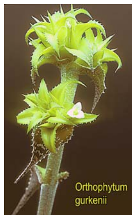
O. gurkenii inflor.