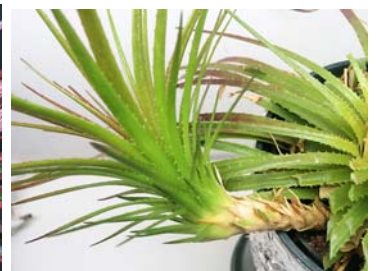
Pup on long stolon